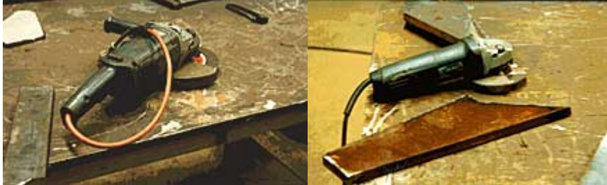
Photo 1. nine inch grinder (left) is noisier than four inch one ( right)

Macmahon Contractors use both four inch and nine inch grinders. Supervisors and employees are instructed in when each type is best used, as the four inch achieves a reduction in noise level at the operator's position of 6 dB(A), from 108 dB(A) down to 102 dB(A).