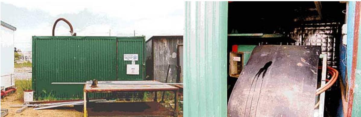
Enclosure built for existing generator

A larger 90 kVA generator set was needed at a shopping centre construction site. An acoustic enclosure was built for an existing generator; enabling people to work close by without being exposed to excessive noise.