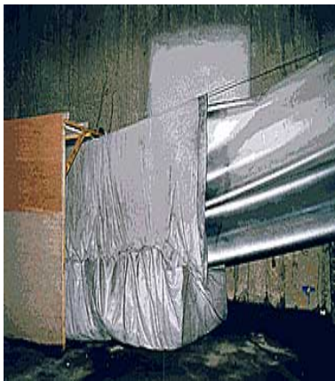
Photo 2. Duct wrapped in geotextile fabric to reduce radiated noise