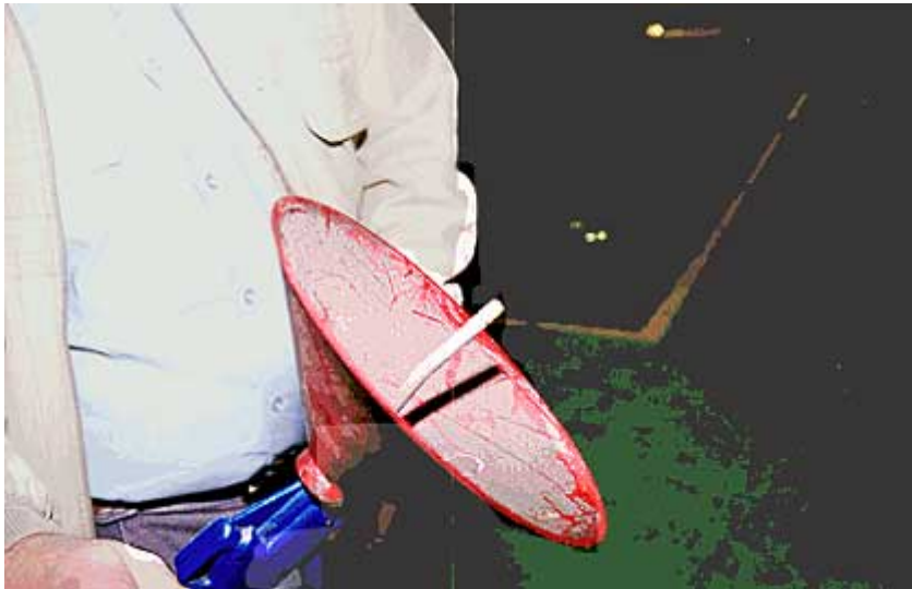
Photo 2. Special cup fitted over air gun nozzle.

However, it is often required to fast dry some parts. For this purpose compressed air is used, again producing very high noise levels. To try to overcome this problem, the air pressure was reduced. This didn't solve the problem so air gun nozzles were fitted with specially designed cups and the work technique was changed. This reduced noise levels at the operator position by 22 dB(A) from 112 to 90 dB(A).