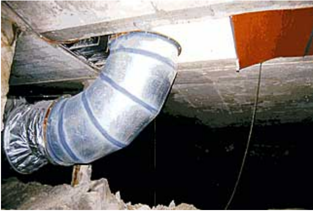
Photo 3. Intake outlet placed outside tunnel away from workers