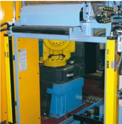
A light curtain used to disable the hazardous mechanism of a machine must resist failure and fault.