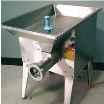
The narrow throat of the mincer prevents a person's hand from accessing the hazard.