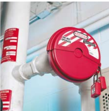
Valve lock and tag.

A tag on its own is not an effective isolation device. A tag acts only as a means of providing information to others at the workplace. A lock should be used as an isolation device, and can be accompanied by a tag.