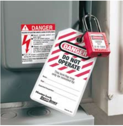
Tag and lock.