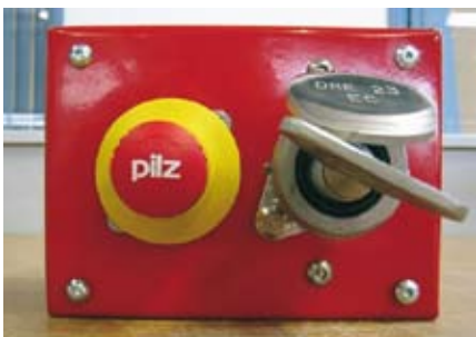
Captive key systems: The key cannot be removed unless it is in the off position. The same key is used to unlock the access gate. Only one key per system is retained by the locking mechanism.

Improved design and technology can be fitted to older machinery and equipment to meet current standards and reflect the latest knowledge regarding ways to control hazards and risks in the workplace.