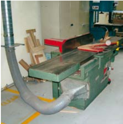
Woodworking dust generated by a buzzer is removed via forced extraction and ventilation.