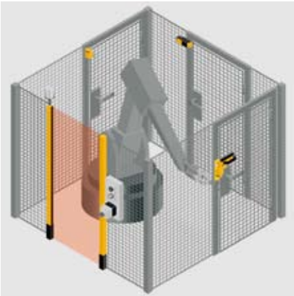
Robotic arms can reach over their base, move with remarkable speed and high force, and can cause injury if controls to separate people from moving plant are not implemented.