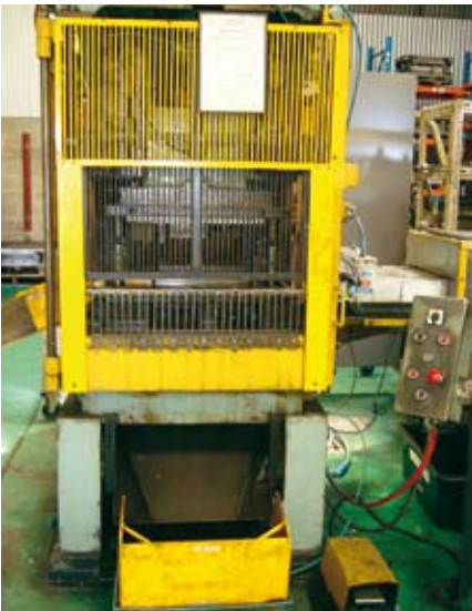
An old style power press incorporating a manual interlock and adjustable guarding. If the guard slides up, a connected metal bar separates the clutch mechanism and the press will not activate.

The guard can be adjusted to provide an opening by releasing retaining bolts on the guard face to allow individual panels to move.