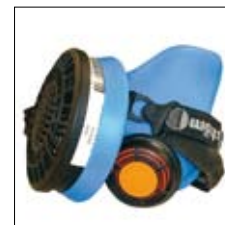
Particle half face respirator.