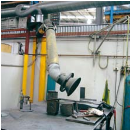
Welding fumes are extracted via flexible, locatable forced extraction and ventilation system.