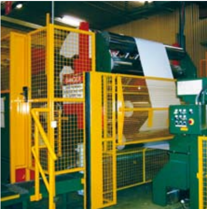
Fences, barriers, guards and interlocked gates separate people from the hazardous action of machinery and equipment.