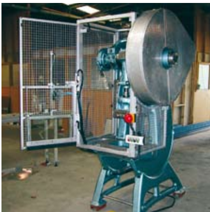
An old style press refurbished with an interlocked safety cage and gate.

The control mechanism uses a combination of pneumatics and electrical interlocking to ensure the danger area of the press cannot be accessed unless the press downstroke action is disabled.