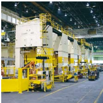
Permanently fixed gantries, ladders and walkways are incorporated into this machinery and equipment to reduce the risk of a fall from height occurring during operation and maintenance.