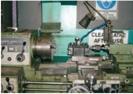
Centre lathe: The exposed rotating chuck of a centre lathe can eject parts or tools with great force, cutting fluid fumes are difficult to contain and the machinery requires manual set-up.