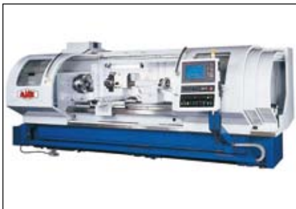
CNC Lathe: Substituting a centre lathe with a CNC lathe (Computer Numeric Control) is an example of improved risk control of machinery and equipment through improvement in design.