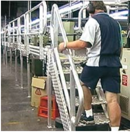
Fixed access platform.