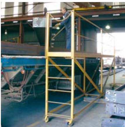
Temporary mobile platform.