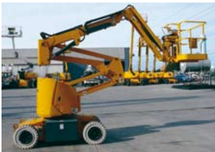
Mobile work platform with fall arrest harness.