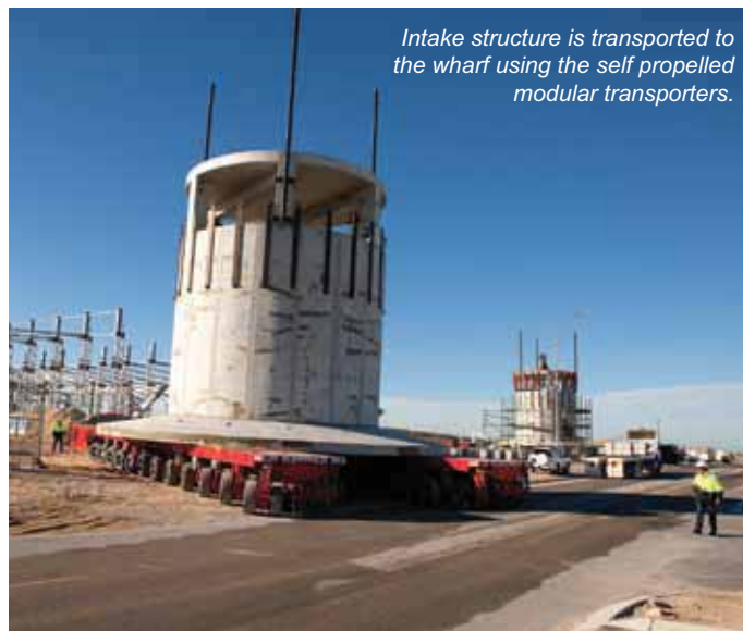
Intake structure is transported to the wharf using the self propelled modular transporters.

The build is just one of the elements of the company’s multi million dollar contract with Southern Seawater Alliance.