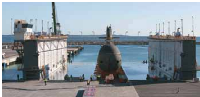
The first Collins Class submarine has been transported on the AMC floating dock.

The AMC floating dock will service the Royal Australian Navy, commercial shipbuilding, marine industry including superyachts and the testing of underwater subsea structures for the oil and gas industry.