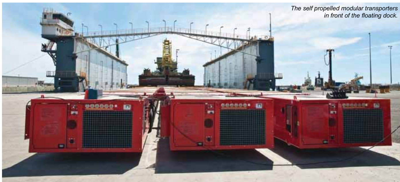
The self propelled modular transporters in front of the floating dock.