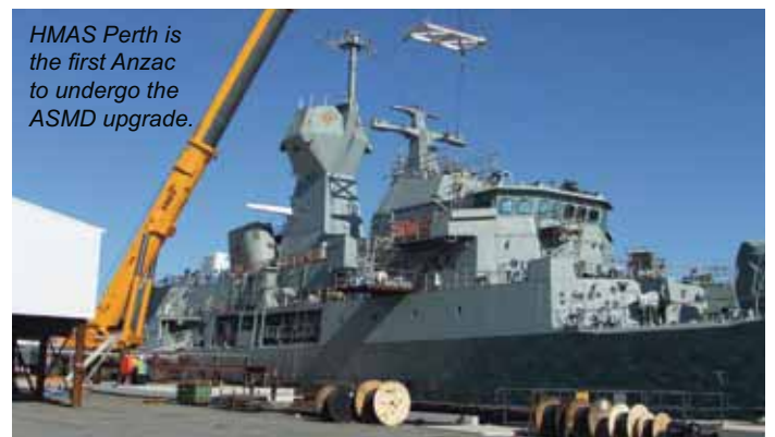
HMAS Perth is the first Anzac to undergo the ASMD upgrade.

For more information on the ASMD program visit www.defence.gov.au/dmo/ and search for ASMD.