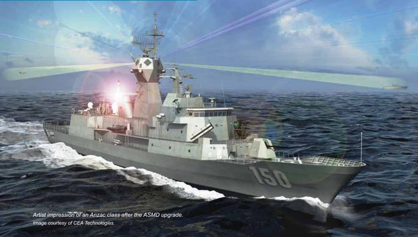
Artist impression of an Anzac class after the ASMD upgrade.