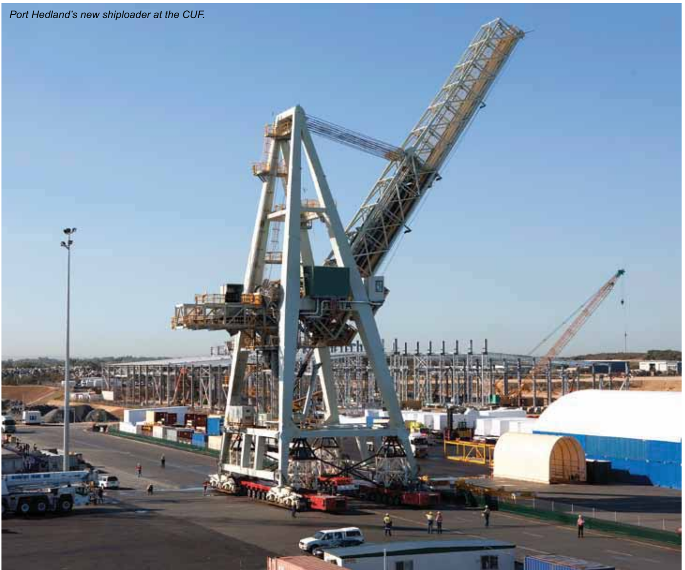
Port Hedland's new shiploader at the CUF.

The shiploader and ore export facility was loaded out from the CUF on 26 May 2010 and is expected to be operational within the coming weeks.