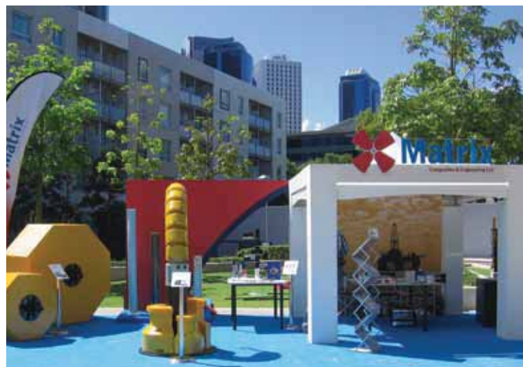
Matrix stands out at AOG.

The Subsea Australasia Conference, which was run in conjunction with AOG, also experienced outstanding attendance with more than 500 delegates participating – making it one of the largest subsea conferences in the world.