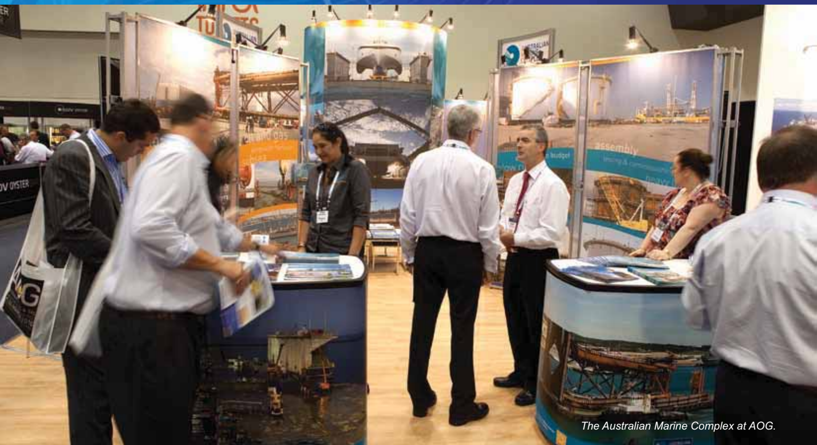
The Australian Marine Complex at AOG.